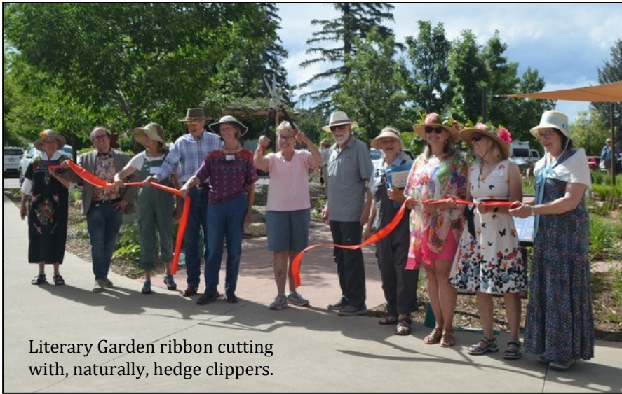
Literary Garden ribbon cutting with, naturally, hedge clippers.